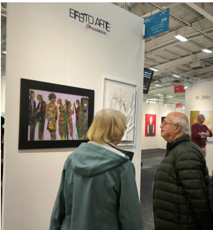
The Effetto Arte Foundation's booth at the previous edition of Artexpo New York.